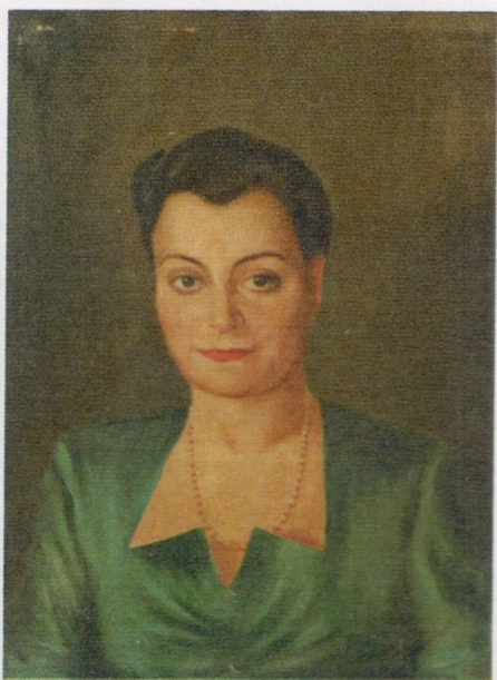
Portrait of Laura Sabia Oil on canvas

Served in the WRNS during the Second World War. Librarian at the St. Catharines Public Library, co-authored “St. Catharines: Canada’s Canal City.”