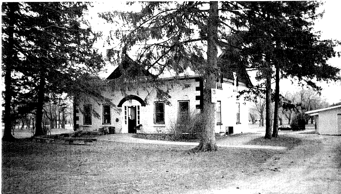
Photo of Theal House